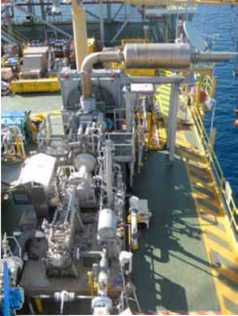
Offshore oil production in Thailand

Our goal is to solve our customers' most demanding technical challenges through the products and services we supply, earning their trust through the reliability they find in our customer service, the quality of our products, the discipline of our Lean manufacturing, the innovation of our engineering and research & development, and the responsiveness of our process consulting and aftermarket services. Our Seneca Falls Operations serve as a cornerstone of our global approach, and evidence of our commitment to continuous improvement and a premier customer experience.