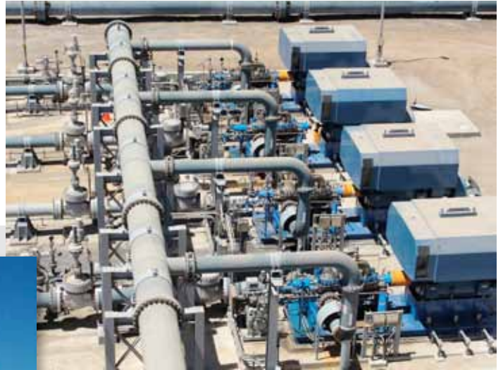
Mine in Chile

ITT Goulds Pumps' Seneca Falls Operations, structured to align with the particular demands of the chemical process, industrial process and highly engineered pump markets, is a focal point within a global organization that provides a full range of pump solutions. Our international network and industry-leading expertise enable us to deliver pumping solutions to every industrial pump market in every geography, responsibly and efficiently.