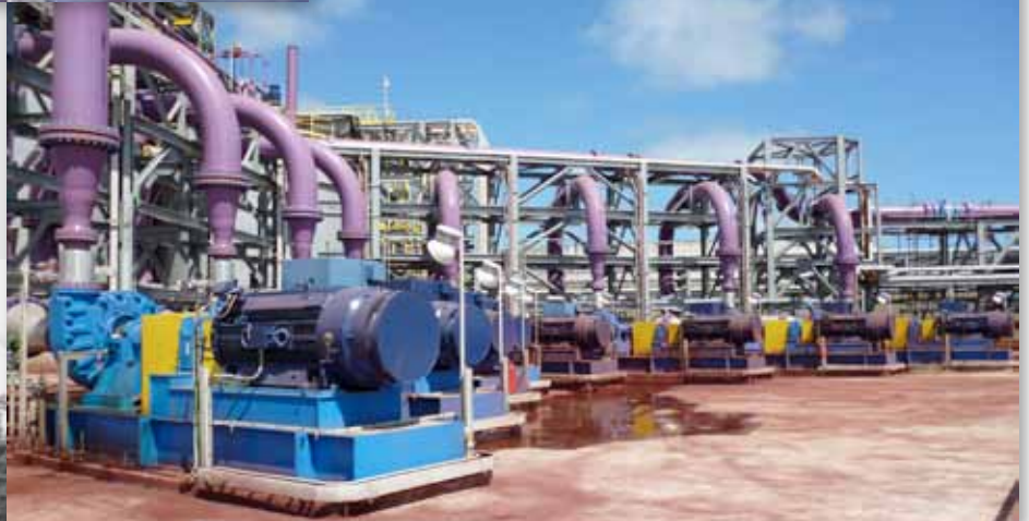
Nickel processing plant in Madagascar