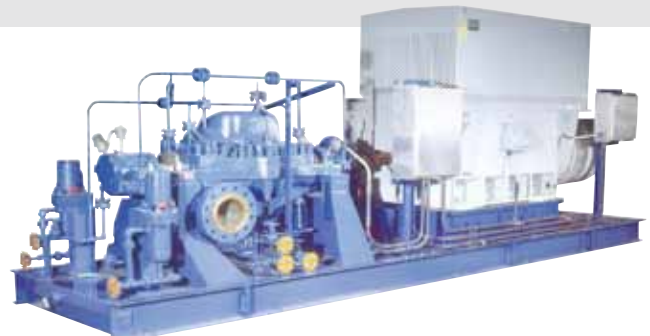
3600 Pump System 12' W x 30' L x 10' H Up to 50,000 lbs.