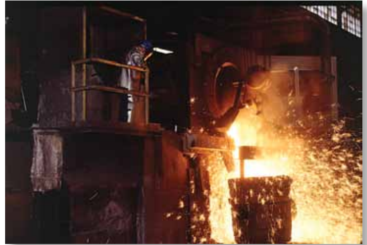
Foundry Focused Factory