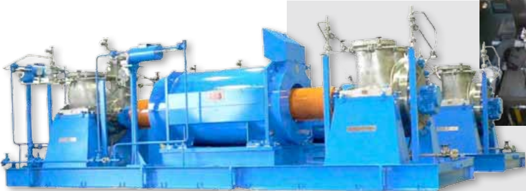
Petrochemical application in China