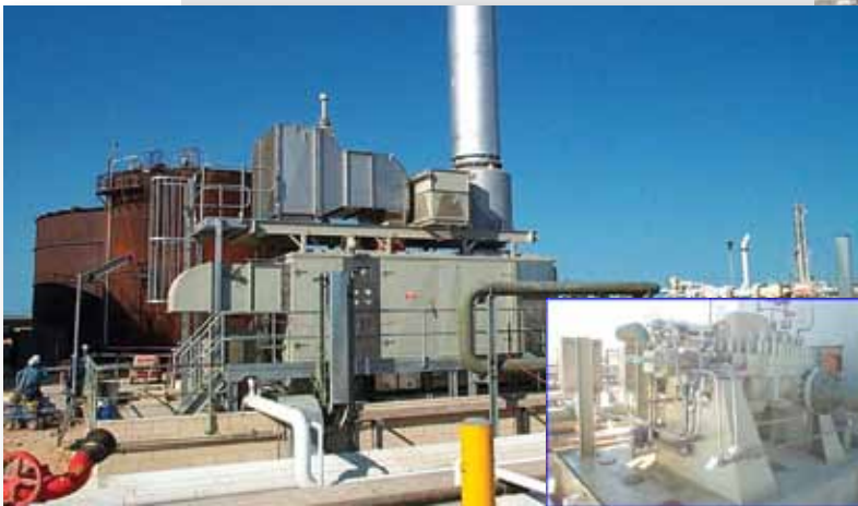
Oil production in Australia