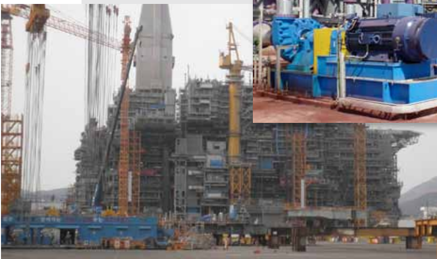
Russian offshore platform