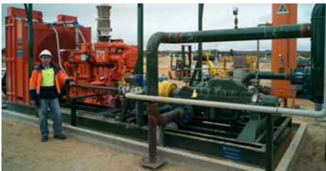
Model 3600 (BB3) in a water injection service located in a demanding Western Australia desert.

ITT is a world leader in technology and engineering, including hydraulics, materials science, mechanical design and fluid dynamics.