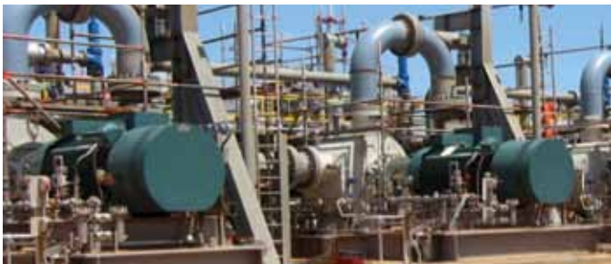
Nearly 80 Bornemann pumps in operation