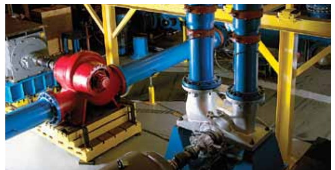
One of our 8000 HP / 6000 kW testing facilities.