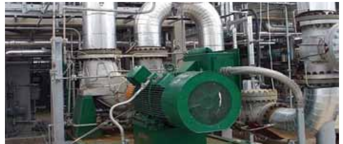
Model 3620 (BB2) boiler feedwater service located in a refinery in Asia.