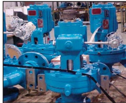
The PRO Services upgrade solution saved 60% over the cost of new equipment.