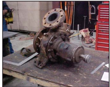
Old pumps were upgraded to meet emission standards.

The 9th pump, on this LDAR-HRVOC project, required a hydraulically re-rated "Custom Drop In" pump to match the hydraulics of two existing pumps. The customer had two Pacific 4x10-1/2 SVE's and one smaller Pacific 4x7 SVE, but wanted all three pumps to perform the same service. This was not possible as the smaller Pacific SVE could not produce the same head and flow as the larger Pacific SVE's. This required the existing smaller Pacific SVE to be replaced with a complete custom designed pump unit that duplicated the performance of the larger SVE. Another requirement was that the replacement unit had to fit into the same "hole" where the existing smaller SVE was located. The intent was not to make piping or