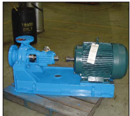
Custom drop-in pump matched hydraulics of the existing pumps.