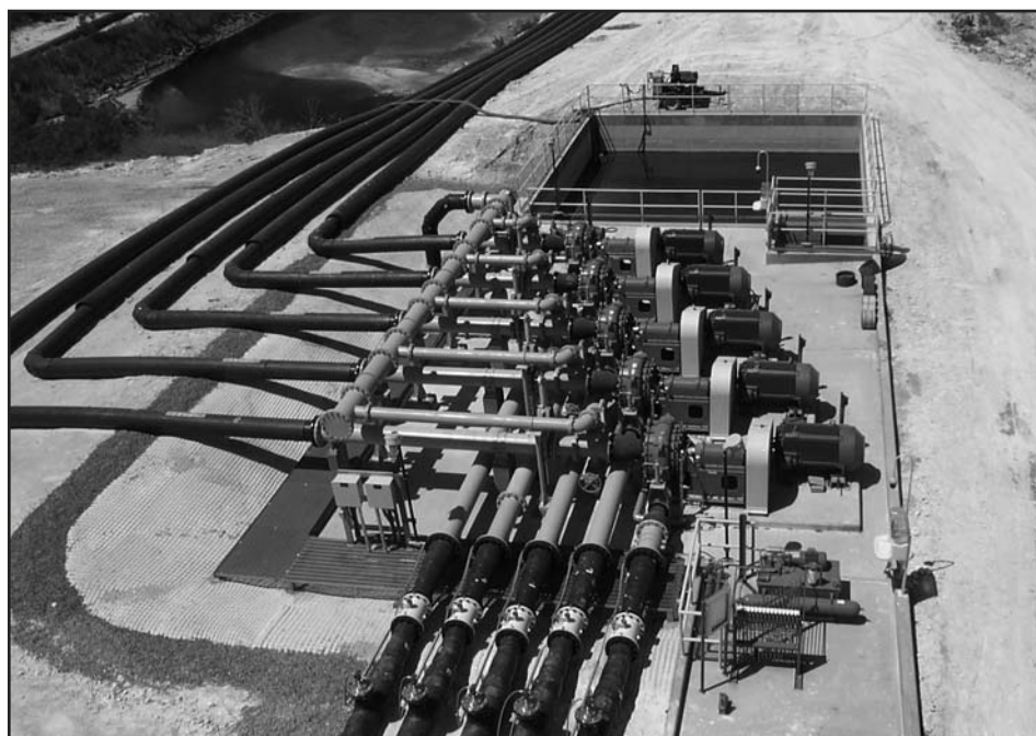
Figure 2. Goulds 8X10-29 Model 5500 Slurry Pumps in Goulds Alloy 1650 on an erosive-corrosive acid gypsum slurry transfer in Lakeland, Florida.

Among the highest chromium abrasion resistant irons, the ferritic grades like alloy 1650 are used in the most demanding erosive-corrosive slurry environments. This alloy is suitable for many acidic slurry services having a pH of 2 or less, such as flue gas desulfurization and acidic gypsum or phosphate slurry environments. A good example of this alloy on an erosive-corrosive service is shown in Figure 2.