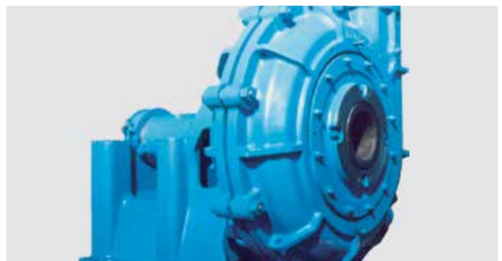
A-C 14x12-36 SRL-XT Pump