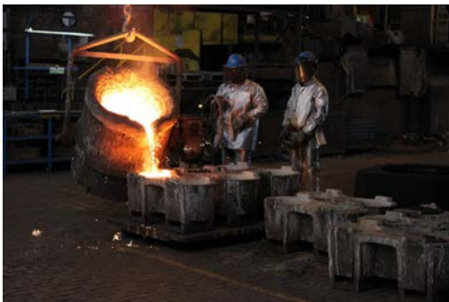
For more than 160 years, the ITT Goulds Pumps foundry in Seneca Falls, N.Y., has produced castings for demanding pump applications.

The truth about casting, in the Bronze Age as now, is that the process contains a range of challenges—from foreign-object contamination to shrinking. Non-destructive testing is one way to ensure that pump castings have integrity and will perform as intended.