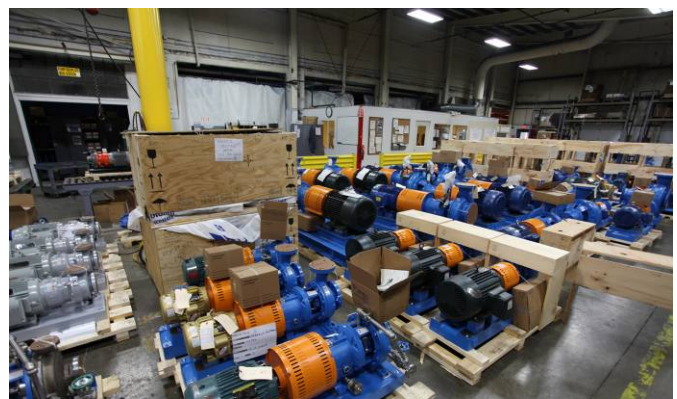
Inspected pumps with certification tags await shipping to customers at ITT Goulds Pumps in Seneca Falls, N.Y.

For obvious reasons, over-testing is not an issue for manufacturers. After all, the more tests