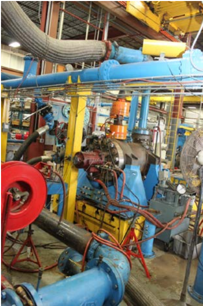
A Goulds Model 7200 High Pressure Multi-Stage Barrel Pump runs on a test loop at the company's facility in Seneca Falls, N.Y.

Liquid Penetrant Inspection. Using a combination of a dye and an ultraviolet light, inspectors look for surface cracks that generally are not visible to the naked eye.